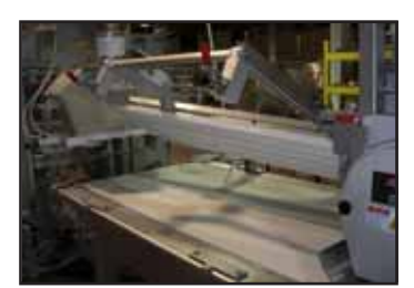
Hinged Rounder Bar with Gas Spring Assist